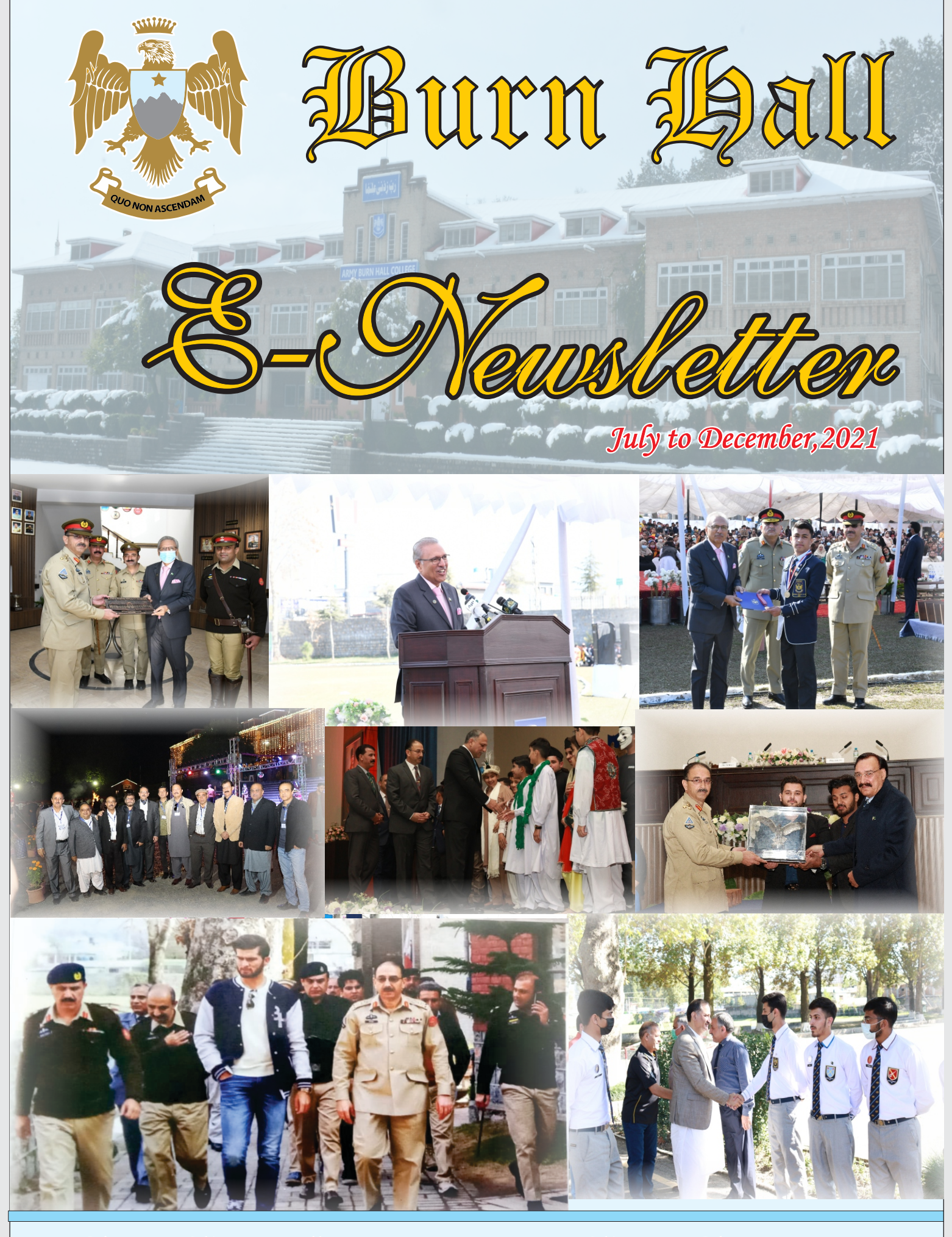
Army Burn Hall College for Boys Abbottabad