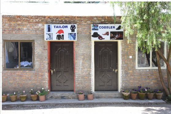
Tailor Shop & Cobbler Shop

Many facilities were extended to suit and fulfill the needs of the Hallians and the Faculty. Among these were Cobbler Shop, Stationery Shop, Tailor Shop, Photography Shop, and Book Shop.