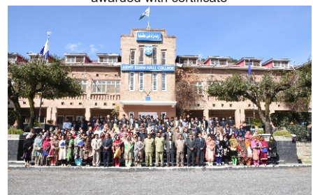
Participants of Teachers Training Workshop with the Principal