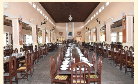
The College Mess

A special emphasis was laid on the renovation of the College Mess. It was provided with new crockery, blinds, honorarium boards, curtains, lights etc. The new mess has become eye-catching after its renovation. Provision of newly constructed washroom was part of the plan.