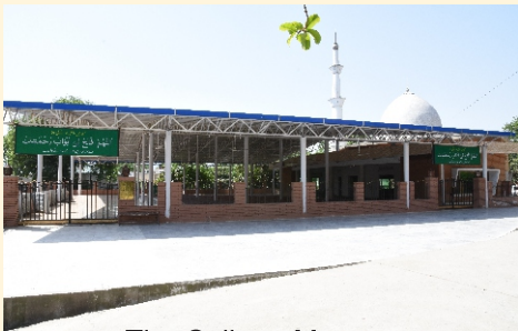
The College Mosque

The renovation of Mosque was carried out meticulously. The provision of new curtains, and Arabic calligraphy i.e. Quranic verses with translation on walls arouse the feelings of inspiration and enhance its sacredness.