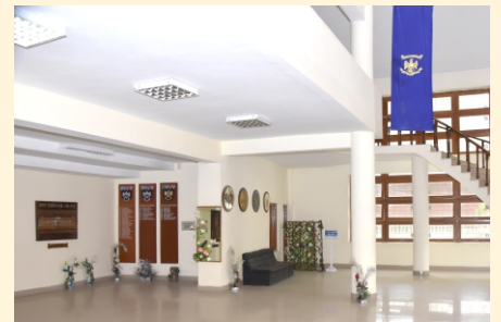
The Scanlon Hall

During the period from Jan till Jun 2017, the College administration undertook a number of projects in order to bring improvement in different administrative and academic areas. Special attention was paid to the improvement of quality living in Campus. The provision of multi-media projector and new sound system, the renovation of its corridors and entrance with portraits, pictures and dry flower arrangements, added to the glory of the Scanlon Hall.