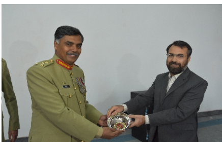
Frontier Constabulary exchanging mementos with the Principal ABHC