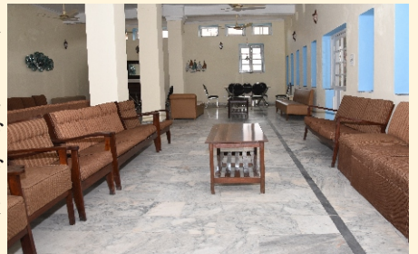
The College Staff-room

To bring the architectural and aesthetic proportion to all the College houses, a series of projects were carried out. Among these were renovation of dorms, installation of LEDs, provision of electrical appliances, procurement of furniture, curtains, blankets, beds and bed sheets; which were aimed at improving the quality of life for the boarding students.