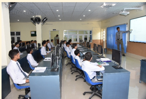
The Language Lab

Establishment of Language Lab through provision of interactive board and computers in all the Sections of the College was another landmark. They are fully equipped and can provide assistance to the Hallians and the Faculty.