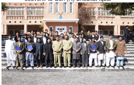
FC KPK Teachers with the Principal and CI of ABHCB