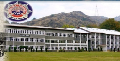
Burn Hall School Sirinagar IHK-1943