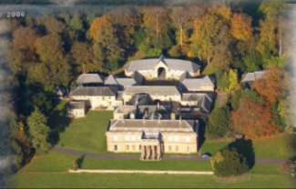
Manor House UK For Mill Hill Missionaries 1866