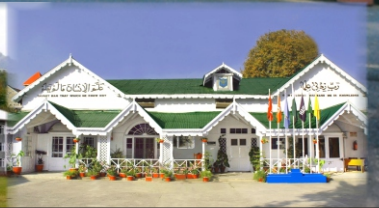
Junior Burn Hall School Abbottabad-1948

Army Burn Hall College for Boys Abbottabad