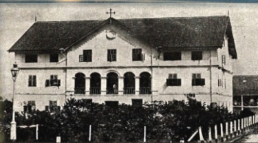
St Joseph's School Baramula IHK-1903